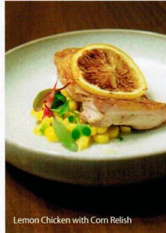
Lemon Chicken with Corn Relish